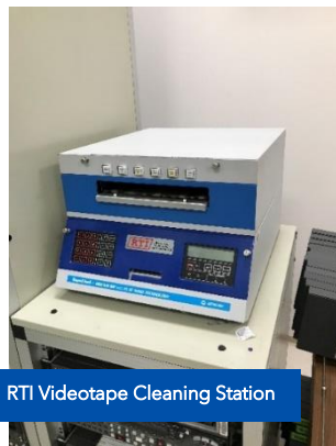
RTI Videotape Cleaning Station

With about 100,000 tapes to process, the intensive digitization phase of the videotape project started in 2016 and is well underway.