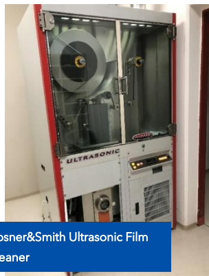
Lipsner&Smith Ultrasonic Film Cleaner

Each frame of the film is stored as a DPX file and all the DPX files for a news clip are then stored in a TAR container file, and a separated digitized audio track.