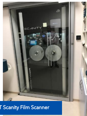
DFT Scanity Film Scanner