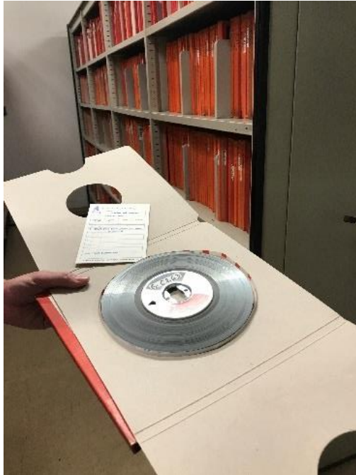
One of 250,000 audio magnetic tape reels

The sheer size of RTVSLO's analog audio archive was intimidating; it consisted mainly of 250,000 reels of magnetic tape. With a team of 15, it took six years to digitize and re-catalog this huge collection of radio content. Today, everything is easily accessible and searchable using a mediArc archive asset management system from NOA. All content is cached on a large RAID and copies of each audio file are stored on highly stable LTO data tape cartridges.