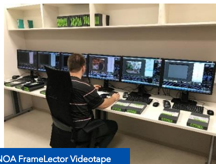
NOA FrameLector Videotape Digitization Workstations