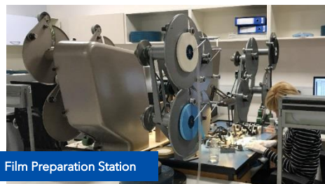
Film Preparation Station